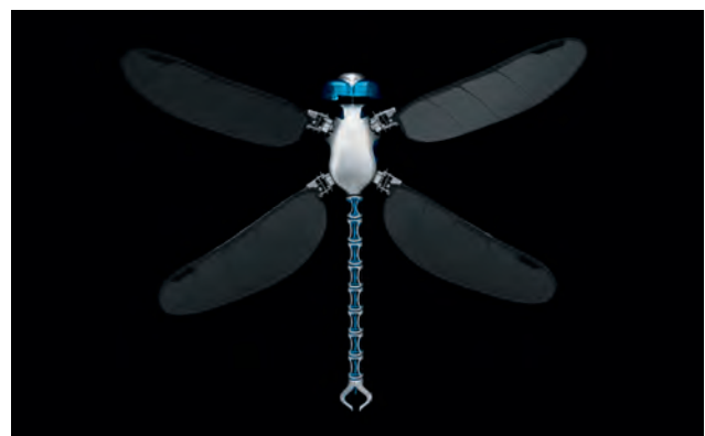
... technically achieved for the first time with the BionicOpter from Festo