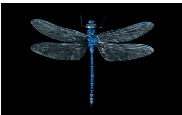
Inspired by nature: the complex wing-flapping principle of the dragonfly ...

The BionicOpter was developed as part of the Bionic Learning Network. Together with colleges, universities and development companies, Festo has spent many years developing and supporting projects and test models whose basic technical principles are derived from nature.