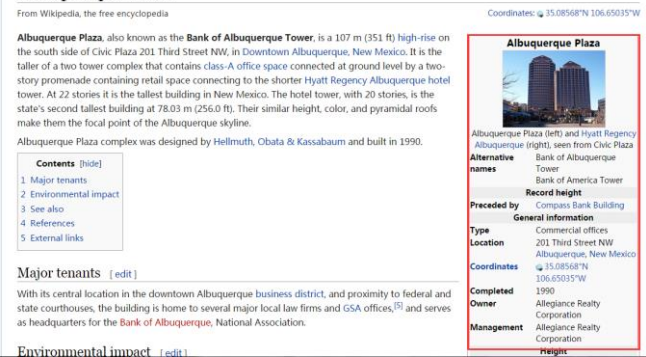
Figure 4.2 Info box of Albuquerque Plaza

4) Common word feature captures words occur both in titles and descriptions of the list and its articles. We can show a portion of common words in positive data set after filtering stop words: highrise, new mexico, height, tallest, albuquerque, state, construction and building.